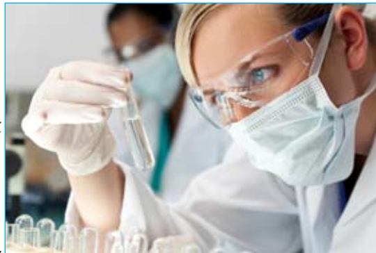
A simple urine test helps determine need for repeat biopsies

In Canada, the PROGENSA PCA3 assay is indicated for use in conjunction with other patient information to aid in the decision for repeat biopsy in men 50 years or older who have had one or more previous negative prostate biopsies. An elevated PCA3 score is associated with an increased likelihood of a positive biopsy. A prostate biopsy is required for the diagnosis of cancer. The PCA3 test is currently available in Canada, but is not covered by provincial continued on page 3